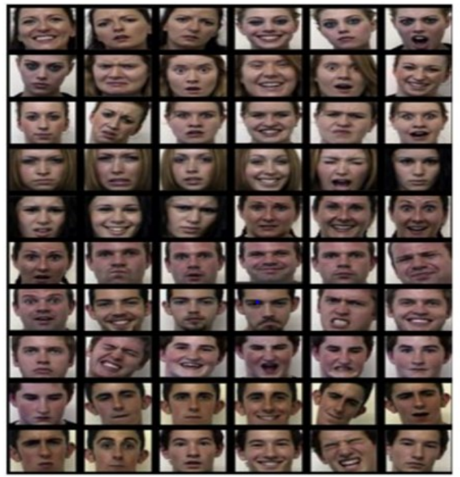
Fig. 3 Face detection.

Moreover system is been tested on datasets <sup>[1,2,3,4,5]</sup> and based on above demonstrated system, results are demonstrated below: