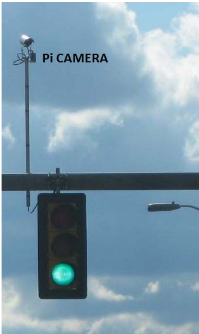
Fig 3 shows a PI –Camera attached with a Traffic light