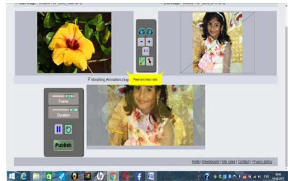
Fig 2:Result of Image Partitioning

Image one shows original image that's supply image that we've got to morph in line with target image, before morphing it's got to do pre process like resizing image to a set price and increased image by using median filter.