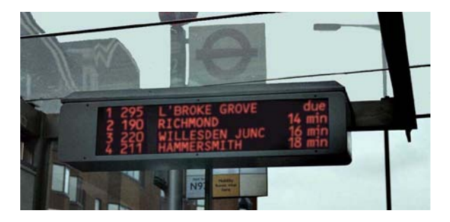
Fig3. Countdown Sign

The Java program will be called every twice minute by the LED Java code that resulted in a shell program which is done in the final implementation. CRON must call the Java program as it has a minimum scheduling resolution of 1 minute for every 30 seconds[4]. The ETA values will be called with the help of Mobile Education's server for every sixth route which sends a command to the display to show that routes name and ETA. Each bus has a specific LED sign that it stops under which has a static IP address. The Java program the IP addresses are hardcoded to display appropriate information on the correct LED sign[4][5].