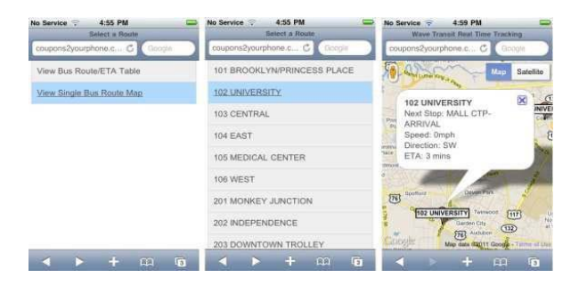
Fig 2. Final Mobile Implementation

The mobile friendly version has a very simple user interface to cut down on load times. It has the option to view a table which is a text based display of a specific route or view a map of a specific route. A map with all buses was left out of the mobile version because it was unusable on a small screen, due to the large number of buses to display. Along with all these improvements a simple implementation of Google's direction service was used to give the user an ETA for the bus to arrive at its next stop. This information includes with the route name, heading, speed, and next stop on all versions of the map along with the table display[3].