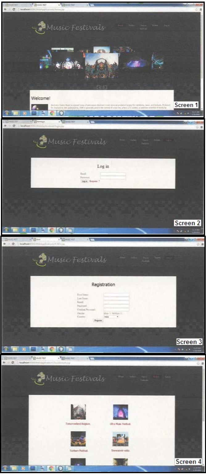
Figure 3. Display Screens