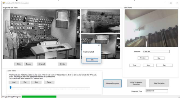
Figure.7: Apply Selective Encryption collectively on Hybrid Frame.

Step 5) Apply Selective Encryption on hybrid frame&note Computed Time (26 Seconds Consumed).