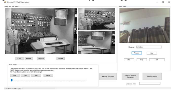
Figure.5: Apply Video Encryption.

Step - 4) After that Video Encryption is applied.