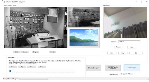
Figure.9: Apply Joint Encryption on Hybrid Frame Collectively.

Step 7) Apply Joint Encryption on hybrid frame & note Computed Time (1 Second Consumed) that improve performance of the system.