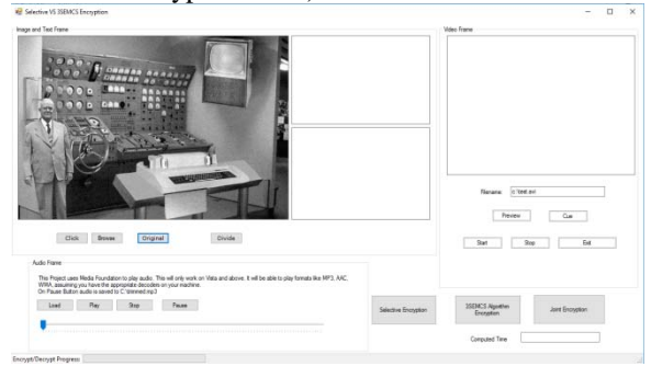
Figure.2: Design of Hybrid Frame. Step -2) Select the portion of an image &divide hybrid frame into three portions.

Step -1) Design Hybrid frame (that includes image, text, audio and video type content).