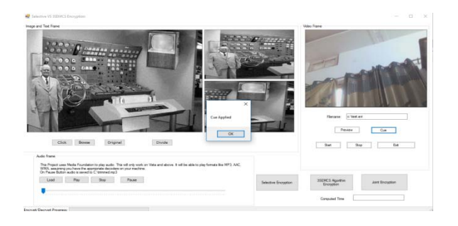
Figure.6: Apply Cue while clicking on Cue Button.