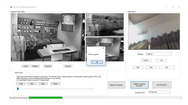
Figure.8: Apply 3 Step Encryption Algorithm.

Step 6) Apply 3SEMCS Encryption on hybrid frame&note Computed Time (10 Seconds Consumed).