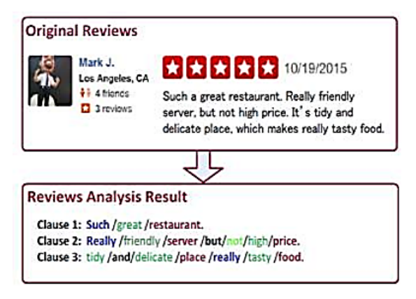
Fig. 3. An example of review analysis for identifying user" s