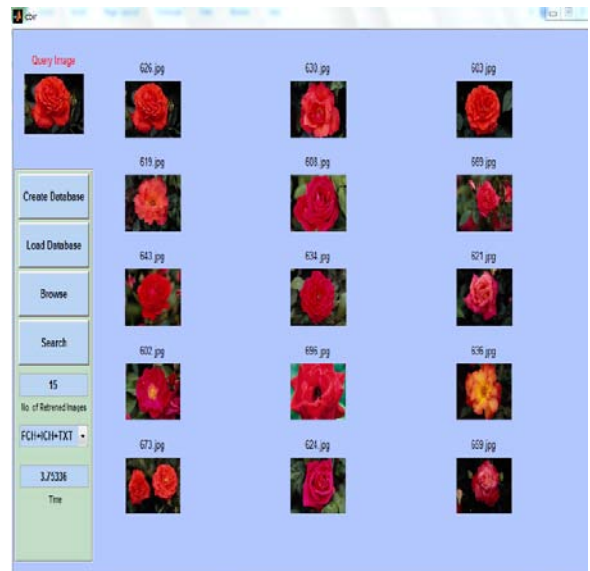
Fig 4.2 Retrieved images based on flower category

Figure 4.1 represents images that have been retrieved on the basis of bus image that has been given to the system as input image. On the basis of input image features of color compositions, texture and shape has been computed that provide information about relevant images.