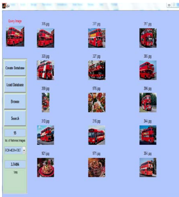
Fig 4.1 Retrieved images based on bus category

Figure 4.1 represents images that have been retrieved on the basis of bus image that has been given to the system as input image. On the basis of input image features of color compositions, texture and shape has been computed that provide information about relevant images.