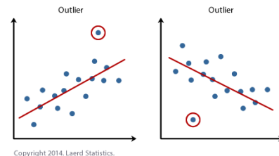
Fig 1. Outlier (the node which deviates from normal node)

The remainder of this paper is organized as follows. Section II outlier detection in wireless sensor networks, Section III outlier detection on traffic monitoring in VANET, Section IV conclusion, Section V references.