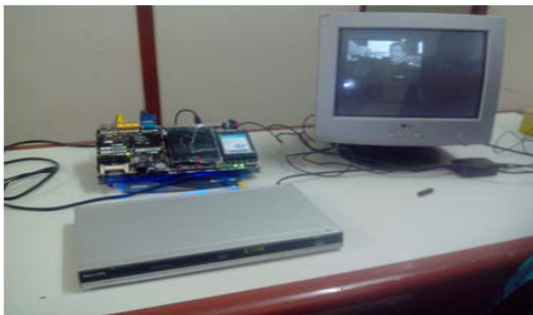
Fig. 3 Setup

From within the OpenBus System, this mapping can be verified using the Configure Processor Memory and Configure Peripherals dialogs, respectively. After placing all the components in the design we now first we need to configure it. After the hardware design, we need to add software to project.