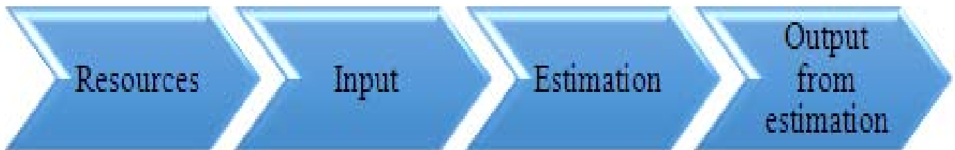
Figure 4: Estimation Process Elements

This paper is a step towards understanding the causes of inaccurate estimates in Agile software development and problems related to estimation in Agile. The projects will be successful if they are delivered on time with the efficient planning.