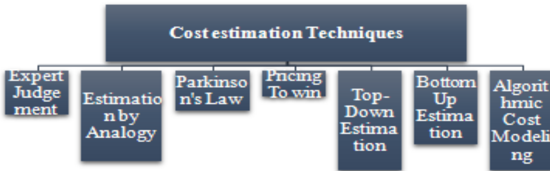
Figure 1: Cost estimation Techniques