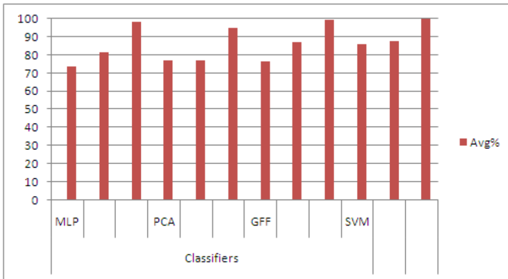
Fig 2: Average recognition of all Vowels for various classifier.

From the above obtained result, it is observed that the handwritten Vowel recognition using SVM classifier on training data is 100%, where as it is 85.74% on testing data and 87.60% on cross validation. The average recognition accuracy of all handwritten Devanagari vowels for MLP, PCA, GFF and SVM on Testing, CV and Training data are shown in following figure 2.