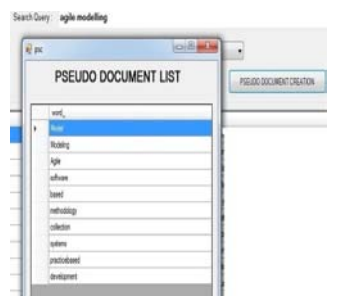
Fig.5: Pseudo document