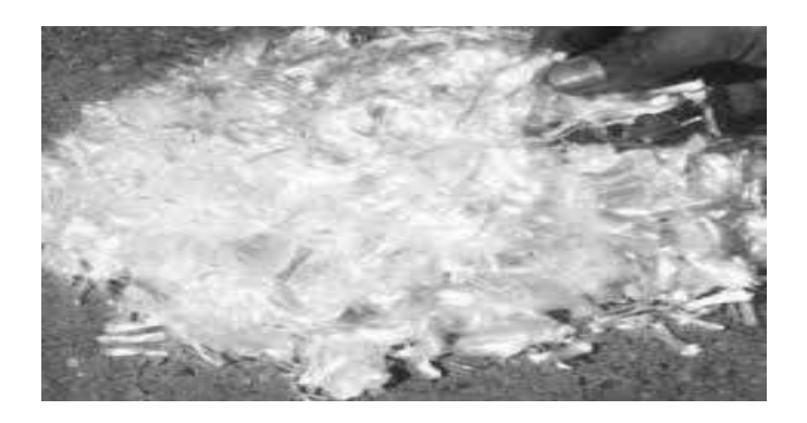
Fig. 6 – Synthetic Fibres

Synthetic fibres are the result of extensive research by scientists to improve on naturally occurring animal and plant fibres. Synthetic fibres are being used to improve the performance of concrete. These fibres are more durable. These can be used to improve the strength of hardened concrete and are used for crack control in semi-hardened concrete. Synthetic fibres help to improve pumpability and keep concrete from spalling during impacts. Synthetic fibres helps to prevent cracking as these do not expand in heat and contract in cold.