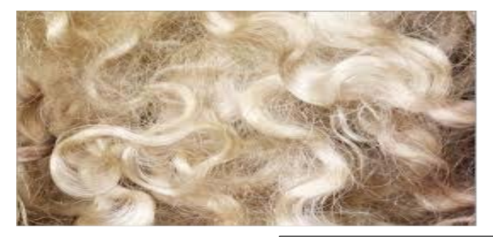
Fig. 7 – Natural Fibres Current development in FRC

The unique aspects of this fibre in the low amount of the energy required to extract these fibres. The primary problem with used of this fibres in concrete is their tendency to disintegrate in an alkaline environment. The effects of being made to improve the durability of this fibre in concrete by using admixture to make the concrete less alkaline and the subjecting the fibres to special treatment. Natural fibres used in Portland cement composite include akwara bamboo, coconut, flax, jute, sisal, sugarcane bagasse, wood, and others mechanical properties of some of these fibres are presented in the succeeding.