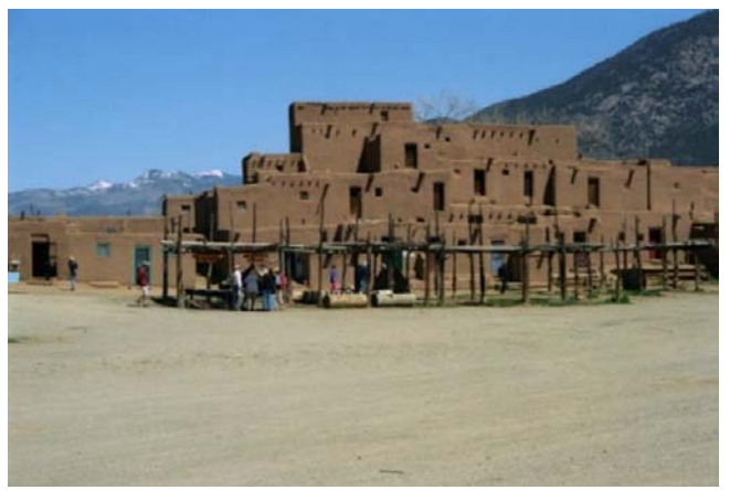
Fig.3 - Pueblo house