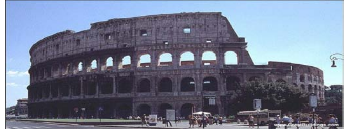
Fig.1 - Roman colosseum