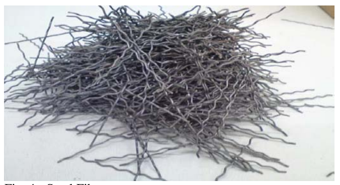
Fig. 4 - Steel Fibres

Steel fibres are most commonly used fibres. Steel fibre reinforced concrete is basically a cheaper and easier to use a form of rebar reinforced concrete. Rebar reinforced concrete uses steel bars that are laid within the liquid cement, which requires a great deal of prep work but make for a much stronger concrete. Fig. 4 shows steel fibre reinforced concrete uses thin steel wires mixed in with the cement. Generally, round fibres are used.