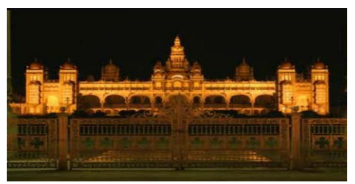
Fig. 2 - Tipu sultan's palace