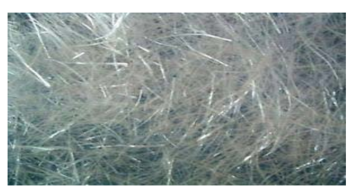
Fig. 5 – Glass Fibres

Glass fibre is a recent introduction in making fibre concrete. Fig.5 shows glass fibre reinforced concrete (GFRC) much like you would find in fibreglass insulation, to reinforce the concrete. The glass fibre helps insulate the concrete in addition to making it stronger. Glass fibre also helps prevent the concrete from cracking over time due to mechanical or thermal stress. In addition, the glass fibre does not interfere with radio signals like the steel fibre reinforcement does. Glass fibre concretes are mainly used in exterior building façade panels and as architectural precast concrete. GFRC uses fine sand, cement, polymer, water, other admixtures and alkali-resistant glass fibres. Glass fibre reinforced cementious composites have been developed mainly for the production of thin sheet components, with a paste or mortar matrix, and fibre content.