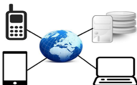
Figure 1. Mobility Features

The birth of the smart phone has changed the way of using different advanced technologies that people all over the world was using previously. Nowadays, people are able to work from home, which saves commuting time in heavy traffic. Also, find is location in any big city becomes very easy and quick with the help of location based services. As we all know facilities always comes along with the challenges, great level security is required to guard the ones' data from unauthorized access over wireless channels.