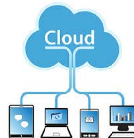
Figure 2. Cloud Storage Concept

Another advance technology, which allows users to access stored data anytime from any location is Cloud computing (Figure 2). Technology like cloud computing can implement and utilized by any individual or organization to improve productivity and performance of the individual as well as the organization and it helps to decrease the complexity and cost at the same time [5].