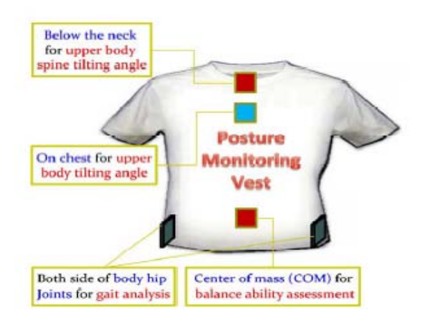
Figure 2. sensor location

Hence detection system needs to be capable of performing gait analysis and can measure the inclination angle of the upper body. For that a wearable device is implemented called posture monitoring vest with 3-axis accelerometers on it for posture monitoring and physical activity detection. The vest carry three locations of accelerometer, first is on the chest for upper trunk inclination angle measurement and another two located on the side of the body for gait analysis and detection of rapid shuffling steps.