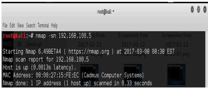
Figure 5: Using Nmap -sn option

This output shows the scanning of network. It will be used for ping scanning.