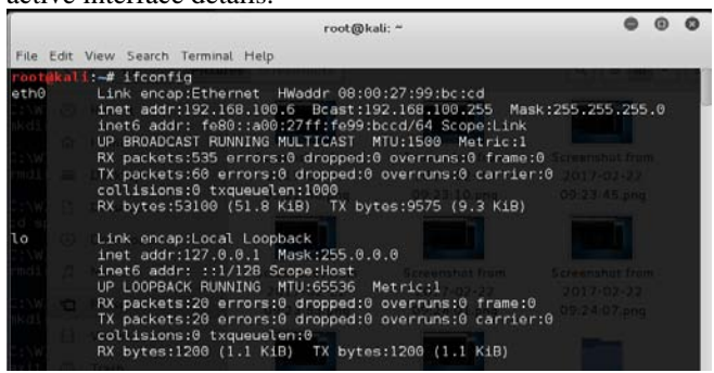
Figure 1: Find local host IP address

We have used if config command to check the assigned IP address of our host machine. It will also display all the active interface details.