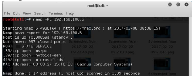
Figure 6: Using Nmap –PE option

The output shows the ICMP echo request and all the ports, State Services and the MAC address of target OS.