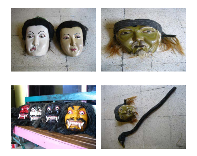
Figure 1. Material Data (Action Figures Photos)

Collecting Material —After doing design, the next step is to do the acquisition items on Dhungkrek Dance Art which include history, figures, videos, and a musical instrument used.