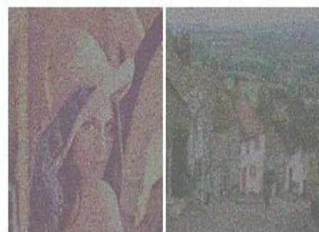
Figure 6 stacking of share 1 and share 2