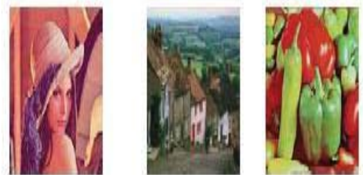
Figure 4 shows cover image over image and secret image

(a) and Fig. 4 (b), respectively. The reconstructed secret image is shown in Fig.6. As the analysis have revealed, scheme can successfully conceal the secret image inside the meaningful shares, and later the secret image can be recovered simply by stacking Share 1 and Share 2 together. However, checking out the analysis in detail, we found that certain areas of the recovered secret image were darker in color than their counterparts in the original secret image. The cause can be either region II or region I, depending on which one was black when Share 1 and Share 2 were stacked. As part of the analysis, we have also verified the security of the shares. Before producing block 3 and block 4, the proposed scheme must first learn the colors of the extracted pixels from the secret image. Then the obtained colors must meet their matches in the coding table so that a suitable block can be produced.