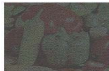
Figure 5 share 1 and share 2