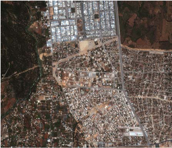
(a) Ikonos image

with similar spectral content but significantly different sizes. All features are normalized to the [0, 1] range using linear scaling. Finally, each region R_i is represented using the feature vector y_i = (r_i, g_i, b_i, s_i) with 4 components.