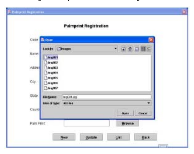
Figure 4. Output Form 2: Palm print Registration