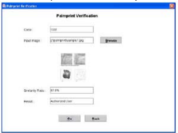
Figure 6. Output Form 5: Palm Print Verification

A feature-level coding scheme for palm print identification is presented. On the top of Palm Code, a number of improvements for developing Fusion Code are made. 1) The circular Gabor filter in Palm Code is replaced by a bank of elliptical Gabor filters. 2) A feature level fusion scheme is proposed to select a filter output for feature coding. 3) The static threshold in Palm Code is replaced by the dynamic threshold. A series of experiments has been conducted to verify the usefulness of each improvement.