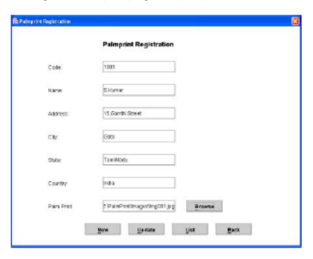
Figure 3. Output Form 1: Palm Print Registration

Palm print images from 284 individuals using the palm print capture device as described in are collected. In this dataset, 186 people are male, and the age distribution of the subjects is: about 89% are younger than 30, about 10% are aged between 30 and 50, and about 1% is older than 50. The palm print images were collected on two separate occasions, at an interval of around two months. On each occasion, the subject was asked to provide about 10 images each of the left palm and the right palm. Therefore, each person provided around 40 images, resulting in a total number of 11,074 images from 568 different palms in our database. The average time interval between the first and second occasions was 73 days. The maximum and the minimum time intervals were 340 days and 1 day, respectively. The size of all the test images used in the following experiments was 384'284 with a resolution of 75dpi. The database is divided into two datasets, training and testing. Testing set contained 9,599 palm print images from 488 different palms and training set contained the rest of them.