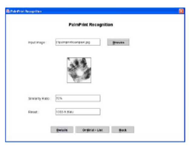
Figure 5. Output Form 4: Palm Print Recognition

The training set is used to adjust the parameters of the Gabor filters only. All the experiments were conducted on the testing set see figure 3, 4, 5, and figure 6. We should emphasize that matching palm prints from the same sessions was not counted in the following experiments. In other words, the palm prints from the first session were only matched with the palm prints from the second session. A matching is counted as a genuine matching if two palm print images are from the same palm; otherwise it is counted as an imposter matching. Number of genuine and imposter matching are 47,276 and 22,987,462 respectively.