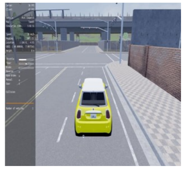
CONCLUSION Traffic lights Recipe

This recipe changes from red to green the traffic light that affects the vehicle. This is done by detecting if the vehicle actor is at a traffic light.