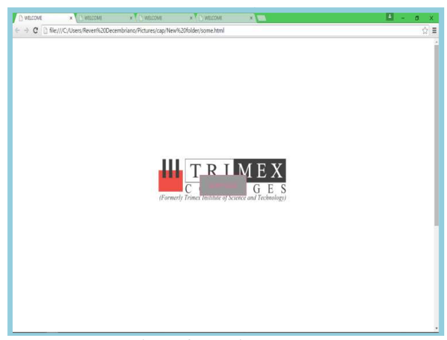
Figure 3 Landing Pages

The image above demonstrates the landing page of the framework you can find in the picture that the client needs to enter their name to enlist yet if they as of now have a record they will not see this part once more. Each application requires just a single record on the off chance that they previously made a record they cannot make another account.