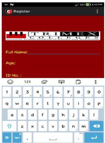
Figure 1 Homepage

The image above demonstrates the rundown of instructional exercise that the client my decision on, it has just four decisions that they can decide on, as should be obvious the other two instructional exercise are bolted they will be open ones the pass the test that is given by the framework.