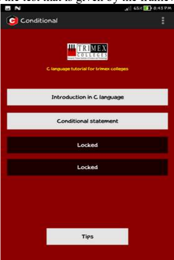
Figure 2 Tutorial Choices

The image above demonstrates the rundown of instructional exercise that the client my decision on, it has just four decisions that they can decide on, as should be obvious the other two instructional exercise are bolted they will be open ones the pass the test that is given by the framework.