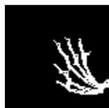
Figure 4: Dynamic signature

Dynamic signature means superimposition of all the Skeleton images between the start and stop images. It indicates the entire gesture motion between start and stop images within a single image. Fig 5 indicates the entire gesture motion.