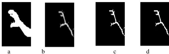
Figure 3: a. Binary hand image. b. Skelton after applying distance transforms. c.Binary Image of b. d. Noise Removal.

by Intel.) [12].Distance transformation method used for generating skeleton.