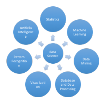
Fig: Elements of Data Science

The techniques that are used in data science are derived from various fields such as Artificial Intelligence, Big data, mathematics, information and communication technologies and statistics [4].