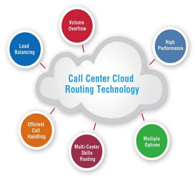
Figure.1 Cloud Centre Routing Technology

literature review and gaps of study, continued with Section 3 discussing the proposed work and paper completes with conclusion & future scope and references.