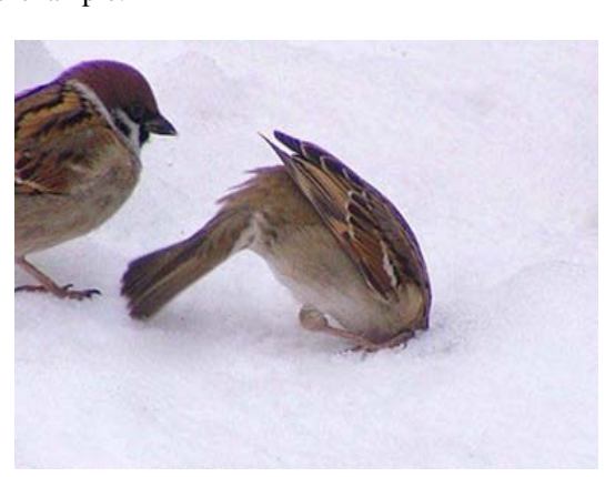
Figure 1. Color image with the size of 88.7 KB

Eliminating the color variations will result a decrease in their size. And this difference between the size of color and grayscale images is the main idea of the algorithm. Here is a typical example: