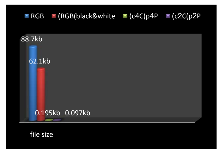
Figure 5. Comparison chart[5]

The P4C algorithm allows us to have an image just for displaying the existing objects by increasing and decreasing the brightness elimination in the program. In the following picture you will see a satellite image from a military environment which is compressed with the P4C algorithm. Military helicopters, cars and buildings is visible in the picture