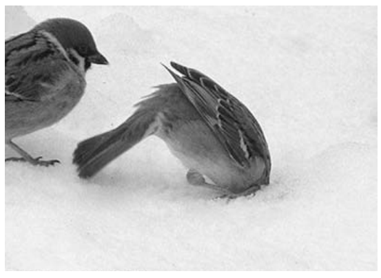
Figure 2. Grayscale image with the size of 62.1 KB

The following picture is a part of a grayscale image that shows more than one color is used.