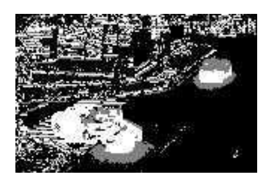
Fig. 2. Example of a Backgroung Subtracted Frame