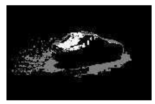
Fig. 3. Example of a Shadow Extracted Frame