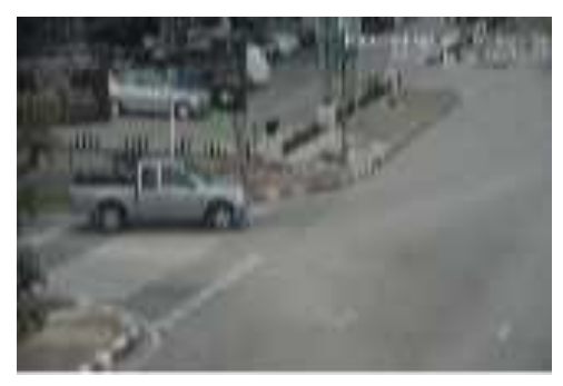
Fig. 1. Example of a Original Video Frame

It is hard to use Weka with the clustering when using it with java. So for this purpose system has come up with an algorithm for using Weka with the classification. For that system has used ClassificationViaClustering filter, and it has many clustering algorithm s provided. System has gone through many approaches and chose the one which gave highest classified instances and lowest root mean squared error. By having those as the parameters system has chosen the SimpleKmeans algorithm as the best approach to clustering.