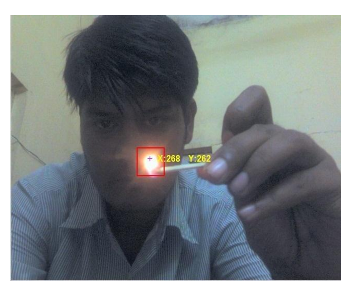
Figure. 3Original RGB images

A fire is an image can be described by using its colour properties. This colour pixel can be extracted into the individual elements as R, G and B, which can be used for colour detection. Noda et al. [18] have used R and G elements and find out that there is a correlation between G/R ratio and temperature distribution, whereas temperature increases, G/R ration also increases. So, due to this, colour of flame can provide useful information to guess on the temperature of a fire and also fire phase. In terms of RGB values, this fact corresponds to the following inter-relation between R, G and B colour channels: R > G and G > B. The combined condition for the fire region in the captured image is R > G > B. Besides, R should be more stressed than the other components, because R becomes the dominating colour channel in an RGB image of flames. This imposes another condition for R as to be over some pre-determined threshold, RT. However, lighting conditions in the background may adversely affect the saturation values of flames resulting in similar R, G and B values which may cause non flame pixels to be considered as flame coloured [21].