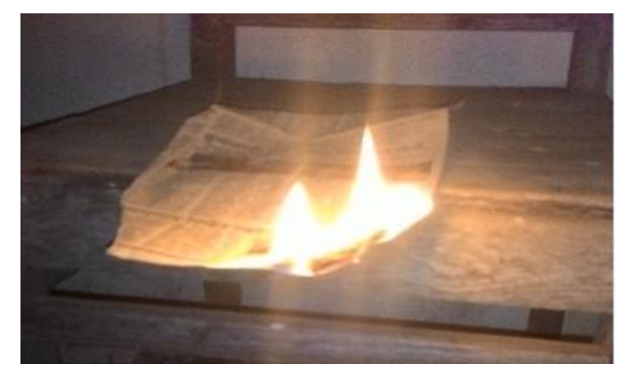
Figure.4(B) motion of second flame