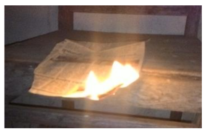
Figure.4(A) motion of first flame.

past several frames, pixels which are not moving for a long time are considered as reliable background in the background registration. This step maintains an updated background buffer as well as a background registration map indicating whether the background information of a pixel is available or not. In the third step, the binary background difference map and the binary frame difference map are used together to create the binary moving pixel map. If the background registration map indicates that the background information of a pixel is available, the background difference map is used as the initial binary moving pixel map. It is done by analysing a different between two consecutive images [20].