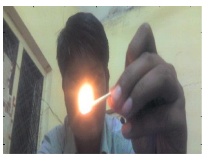
Figure. 2 (A) Original image.

detection, similarly finding a unorganized signals over time is called change detection. Edge detection is fundamental tool in image processing and computer vision, particularly in the area where feature is used. Edge detection is widely used in operation where we want to find the pattern or processing in image. The main reason is to use Edge detection for forming the outline of an object. An edge is boundary between the background and the object in the image. Also, to identify boundaries between overlapping objects. This means that if the edges in image can be identified accurately, all of the object can be located and basic property such as area, perimeter and shape can be measured. Since computer vision involve the identification and classification of object in an image, edge detection is an essential tool. In fire and flame detection the edge detection used to find particular pattern and shape of flame. So that it can distinguish between the actual fire and another source of light such as streets light, vehicles light etc.