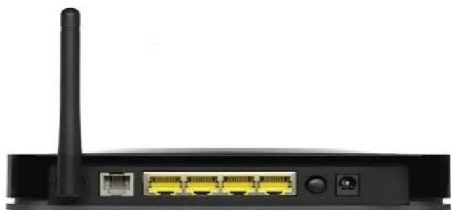
Figure: 1 Sample Router Image (Positive Image)