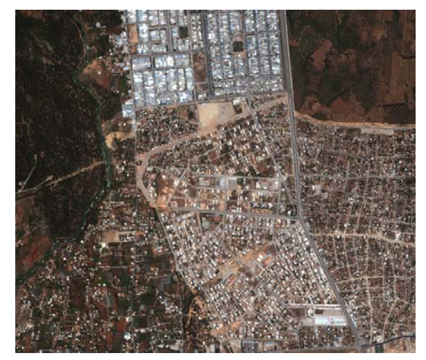
(a) Ikonos image

with similar spectral content but significantly different sizes. All features are normalized to the [0, 1] range using linear scaling. Finally, each region Ri is represented using the feature vector yi = (ri, gi, bi, si) with 4 components.