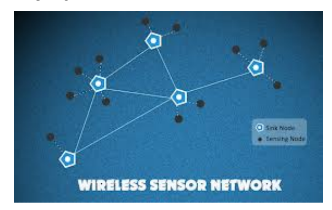
Figure 1. Interconnection of WSN

different research areas: sensing, communication, and computing.